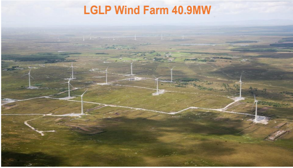
LGLP Wind Farm 40.9MW

In 2022, Ireland imported 81.6% of its total primary energy requirement, one of the highest ratios in Europe (Source: SEAI - Energy in Ireland 2023 Report (12/2023)). The more of its own energy Ireland can produce, the less vulnerable it would be to foreign policy and conflict interrupting gas, oil, and electricity supply lines. There is an opportunity to continue developing a strong indigenous wind industry, that will take advantage of Ireland's excellent wind resource, reducing our import dependency.