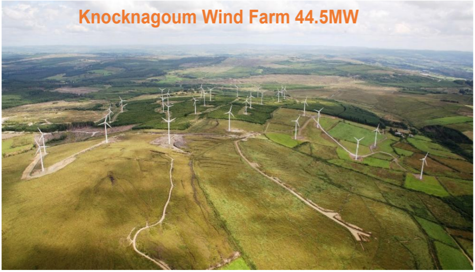
Knocknagoum Wind Farm 44.5MW